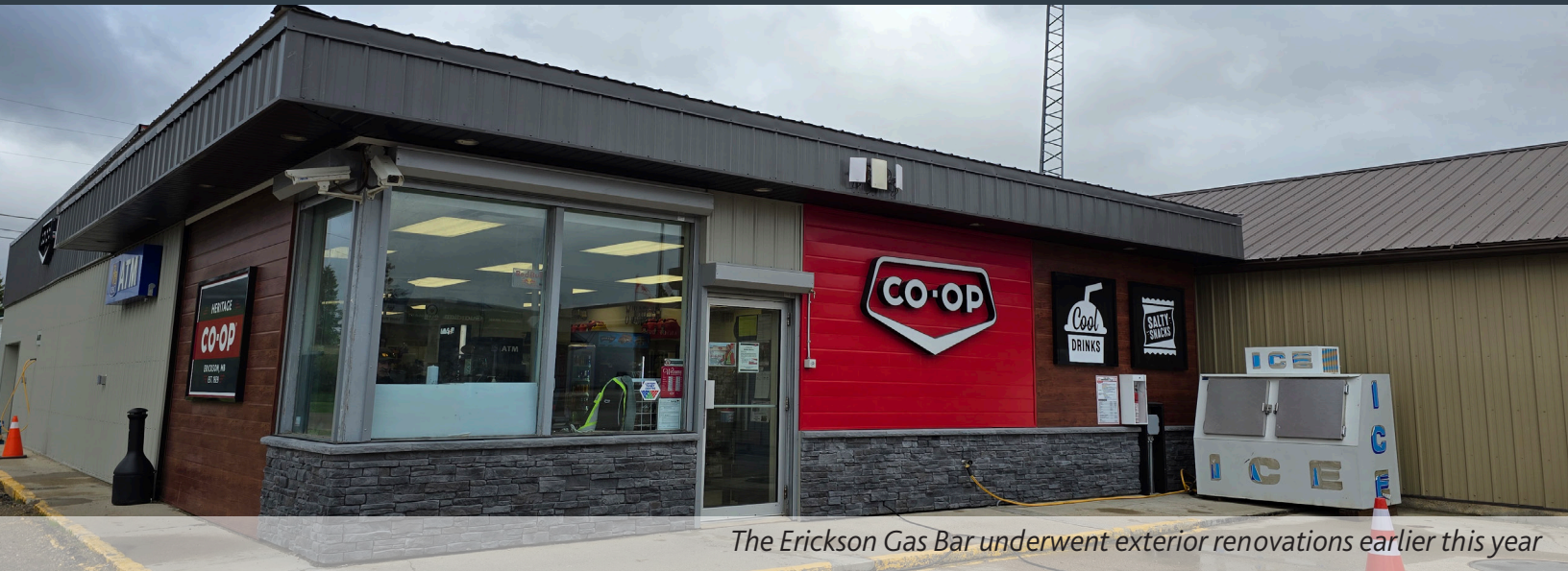
The Erickson Gas Bar underwent exterior renovations earlier this year