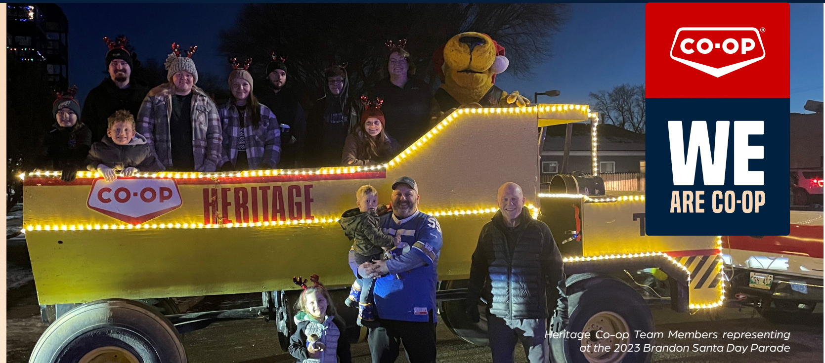
Heritage Co-op Team Members representing at the 2023 Brandon Santa Day Parade